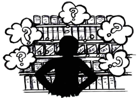
Now What Do I Choose?

For the retailers this is a 'win-win' situation, as they are able to capture a part of the growing ethical consumer market, while showing them selves to be supporters of products the integrity of which is beyond question. In this way they can promote themselves as good corporate citizens.