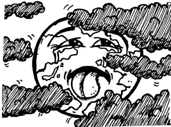
Look What's Happening To Me!