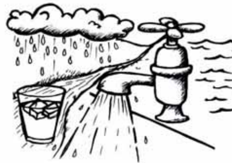
Think! Before you turn on the Tap