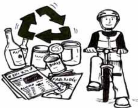
Recycle and Cycle